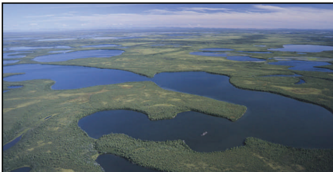
Old Crow Flats.

Vuntut National Park is located in Yukon’s far north next to the Alaskan border. To its north is Ivvavik National Park; and Alaska’s Arctic National Wildlife Refuge is to the west. The