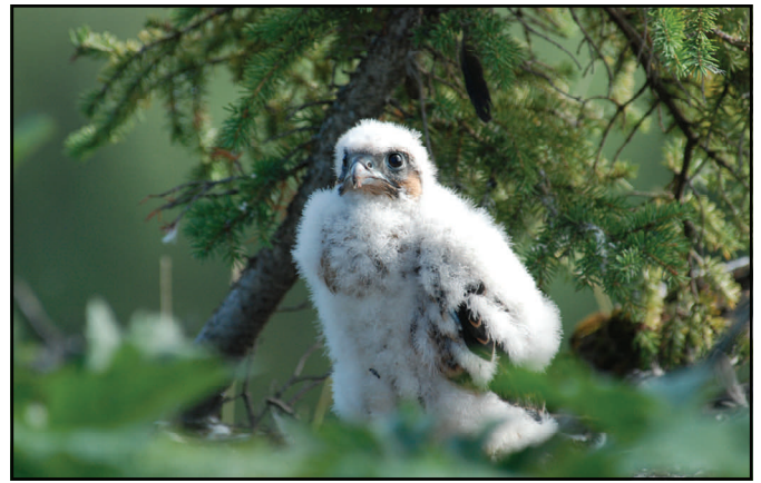
Peregrine falcon chick.

Predators include wolf, grizzly bear, lynx, fox, wolverine and mink, as well as golden eagle, gyrfalcon and peregrine falcon.