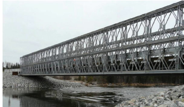
New bridge at Wipanipanis Rapids

Table 2 summarizes changes and threats to Hayes River Natural, Cultural and Recreational Heritage Values since 2006. Values which have not been subject to any change are not listed in the table.