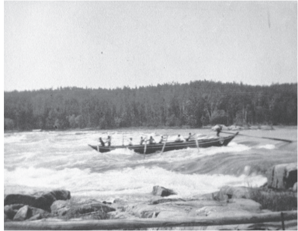
York boat shooting rapids (1910)

Ongoing and varied research conducted for or by Manitoba Hydro in the Hayes River area, as well as by researchers and other agencies, continually enhances knowledge about wildlife, plants, and erosion and other natural processes occurring in the river corridor. The Hayes has remained free of hydroelectric developments and studies often use it as a baseline comparison for the Nelson River, which contains significant hydroelectric infrastructure. Active mineral exploration licences and mining claims continue to exist in the Hayes River area today but are not known to be causing negative impacts to the river corridor.