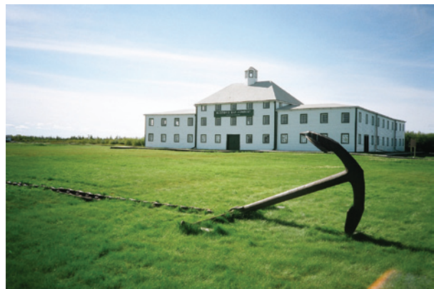
The depot building at York Factory National Historic Site

the company's centre of operations for over 200 years and is now a National Historic Site (NHS) of Canada. Many European explorers also used the route as a gateway to inland exploration and commerce. River travellers today are likely to find evidence of the river's fur trade history, such as grave sites, trapper's cabins, the ruins of Hudson's Bay Company outposts, and other remnants of the industry. In addition to York Factory, other prominent Hudson's Bay Company posts along the route included Norway House and Oxford House, which are modern Indigenous communities today.