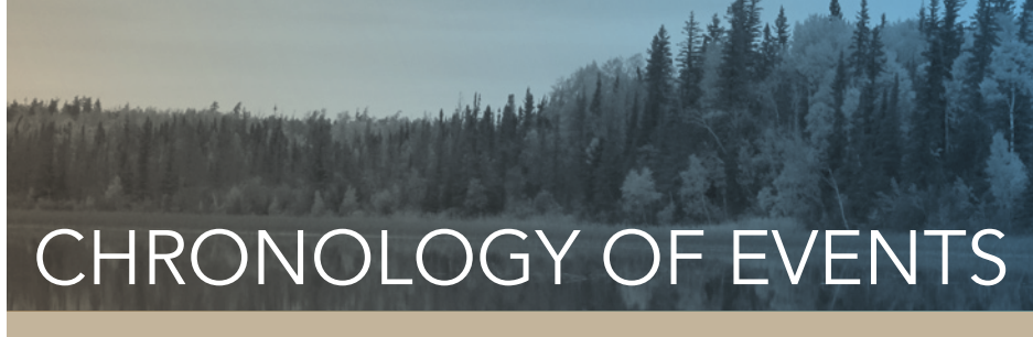
Table 1 lists Hayes River-related events, actions, research or studies that occurred since designation in 2006.