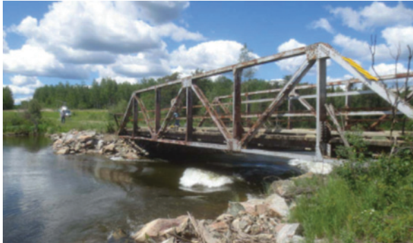
Old bridge at Wipanipanis Rapids