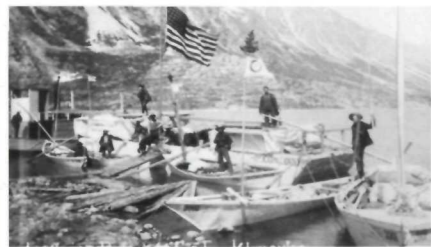
Homemade boats built with the surrounding timber at Lake Bennett had to be trusted to make the 560 mile journey on the Yukon River to Dawson City, Yukon. The gold seekers fought dangerous rapids, wind swept lakes and the wild frontier while navigating the river system.