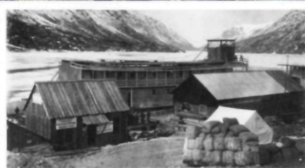
Numerous boats were brought onto Lake Bennett and the river system to accommodate the building of the northern reaches of the Yukon. The boats aided in the moving of supplies and people including tourists waiting to experience the Klondike Gold Rush in person years after all the stakes had been claimed.