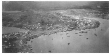
On June 1, 1898, the shores of Lake Bennett were teeming with gold hungry stampeders ready to make their way down the Yukon River system to Klondike Gold Fields in Dawson City, Yukon.