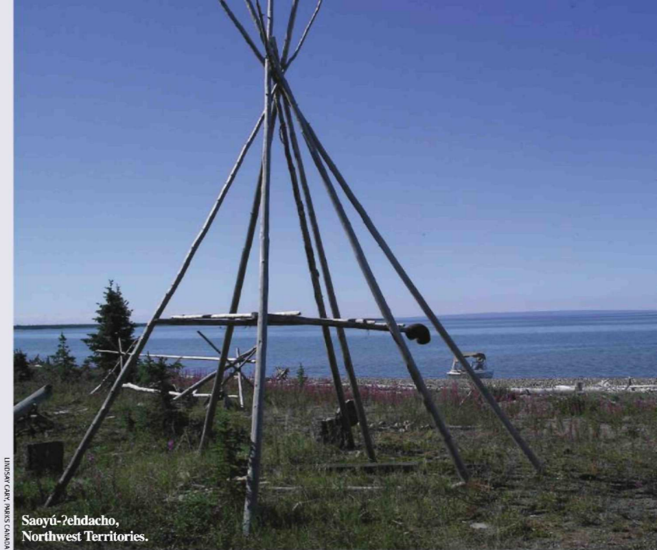
Saoyú-?ehdacho, Northwest Territories.

"Inuit women made clothing for his parties, the men hunted, they led sledging excursions, they helped Peary in