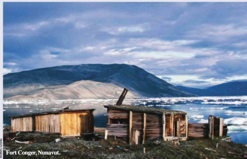
Fort Conger, Nunavut.

Fort Conger, on northern Ellesmere Island, is even more remote. The site was an important staging area for North