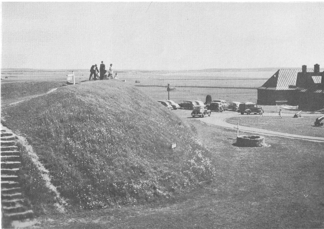
Original Earthen Bastion of French Period