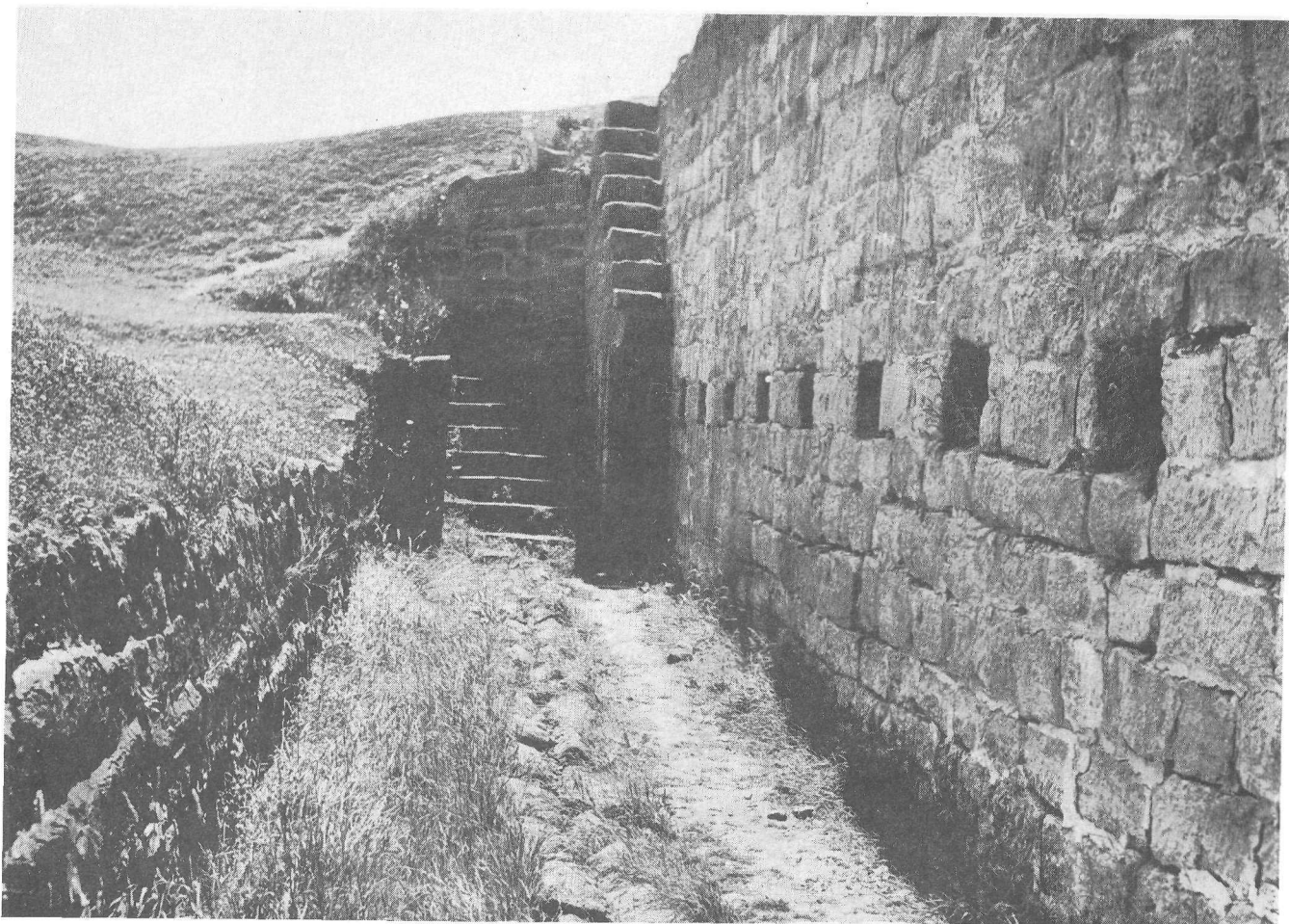
Interior of Old Fort showing Loop-holed Curtain Wall