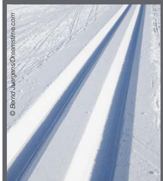
Track set for classic skiing only