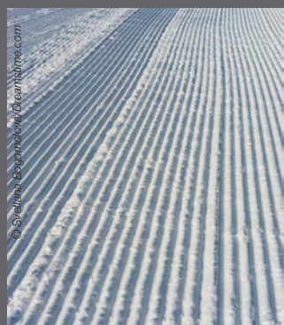
Flat grooming for other users

In Banff National Park, we share the trail: