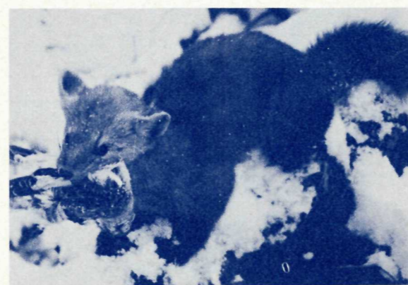
Nature's law of survival in action.

Great icefields still cover large areas in the high mountain country on the Continental Divide, where there is considerable precipitation, much of it in the form of snow. Glacier tongues of these icefields are visible from the Banff-Jasper Highway: the Crowfoot, Bow and Peyto Glaciers are examples. Meltwaters from the glaciers form many beautiful streams and waterfalls and are the chief source of water on the Continental Divide. Where the meltwater pours into a flat valley, lovely green lakes accumulate, many of them dammed by glacial moraines. Among these lakes are Lake Louise, Bow Lake, Hector Lake, and Peyto Lake, and there are many others not seen from the highway.