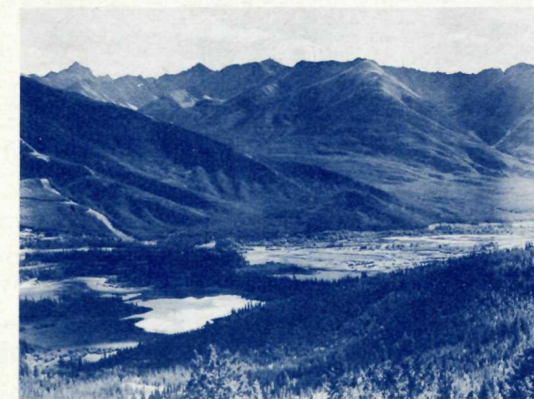
An abundant variety of plantlife is seen in the valley of the Bow River.

For the protection of mountain climbers, all mountain travel off the park trails must be registered with the District Warden, before and after the climb. Inexperienced climbers should obtain the services of a guide and full information concerning the necessary equipment.