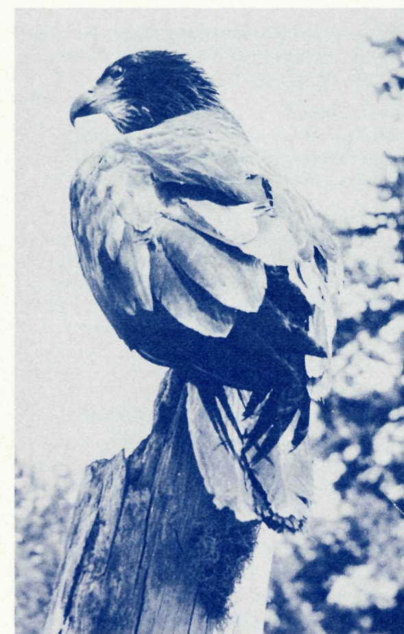
A young golden eagle surveys his domain.

In the lower valleys are found an interesting blend of mountain and prairie flowers, varying with environment. The Indian paint brush is one of the most interesting plants to see, varying in colour and size but found at all altitudes. Several small orchids occur in the coniferous forests of the main valleys. The yellow avalanche lily and the chalice-cup or western anemone poke their heads through the snow at timberline in late June. Some of the best meadows in which to see flowers are within walking distance of the Tunnel Mountain campground, and along Highway 1A west of Banff. The flowers of the forest and river bank