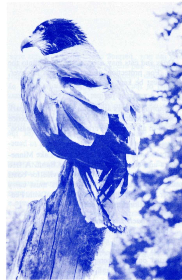
A young golden eagle surveys his domain.

In the lower valleys are found an interesting blend of mountain and prairie flowers, varying with environment. The Indian paint brush is one of the most interesting plants to see, varying in colour and size but found at all altitudes. Several small orchids occur in the coniferous forests of the main valleys. The yellow avalanche lily and the chalice-cup or western anemone poke their heads through the snow at timberline in late June. Some of the best meadows in which to see flowers are within walking distance of the Tunnel Mountain campground, and along Highway 1A west of Banff. The flowers of the forest and river bank