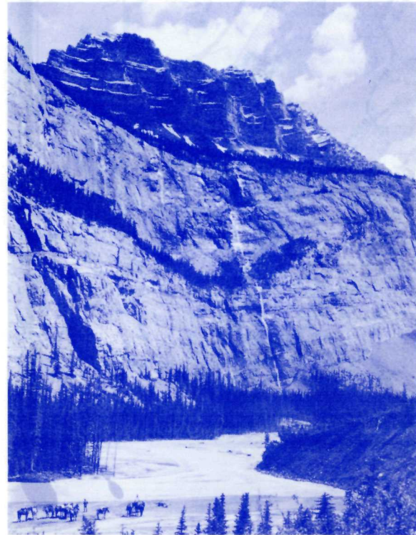
Centuries of erosion are etched in these rocks.

Although the area is not on a major flyway, many interesting birds live in the Park or migrate through it. Some 185 species have been reported to date. Mountain music is provided by the tiny ruby-crowned kinglet, seldom seen but often heard from the top of the largest conifer in his territory.