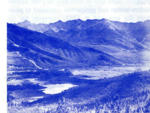
An abundant variety of plantlife is seen in the valley of the Bow River.

For the protection of mountain climbers, all mountain travel off the park trails must be registered with the District Warden, before and after the climb. Inexperienced climbers should obtain the services of a guide and full information concerning the necessary equipment.