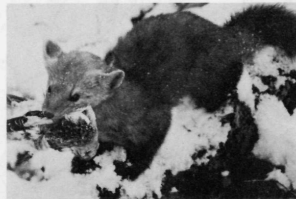
Nature's law of survival in action.

Great icefields still cover large areas in the high mountain country on the Continental Divide, where there is considerable precipitation, much of it in the form of snow. Glacier tongues of these icefields are visible from the Banff-Jasper Highway: the Crowfoot, Bow and Peyto Glaciers are examples. Meltwaters from the glaciers form many beautiful streams and waterfalls and are the chief source of water on the Continental Divide. Where the meltwater pours into a flat valley, lovely green lakes accumulate, many of them dammed by glacial moraines. Among these lakes are Lake Louise, Bow Lake, Hector Lake, and Peyto Lake, and there are many others not seen from the highway.