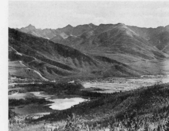
An abundant variety of plantlife is seen in the valley of the Bow River.

For the protection of mountain climbers, all mountain travel off the park trails must be registered with the District Warden, before and after the climb. Inexperienced climbers should obtain the services of a guide and full information concerning the necessary equipment.