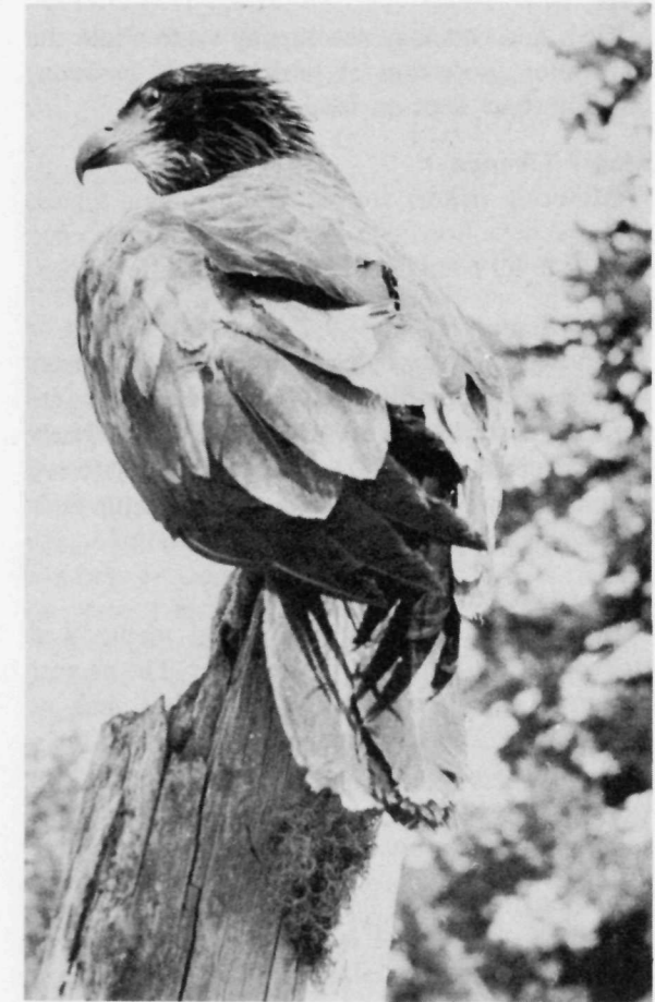
A golden eagle surveys his domain.

In the lower valleys are found an interesting blend of mountain and prairie flowers, varying with environment. The Indian paint brush is one of the most interesting plants to see, varying in colour and size but found at all altitudes. Several small orchids occur in the coniferous forests of the main valleys. The yellow avalanche lily and the chalice-cup or western anemone poke their heads through the snow at timberline in late June. Some of the best meadows in which to see flowers are within walking distance of the Tunnel Mountain campground, and along Highway 1A west of Banff. The flowers of the forest and river bank