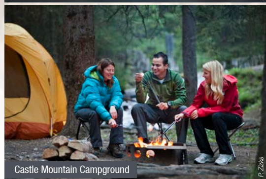
Castle Mountain Campground