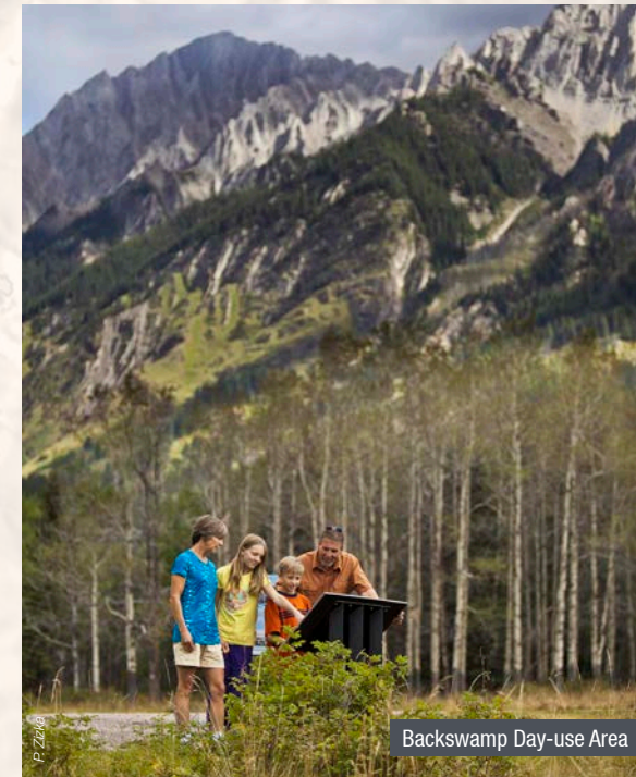
Backswamp Day-use Area

Whether you want a scenic excursion, a delicious meal in a quaint bistro, or a place to spend the night, the Bow Valley Parkway is always worth the visit.