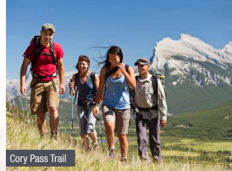
Cory Pass Trail

Did you know that the Bow Valley Parkway is also a continuation of the Banff Legacy Trail linking Banff and Lake Louise as a cycling route?