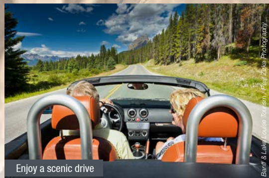
Enjoy a scenic drive