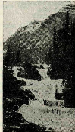
Giant Steps, Paradise Valley

Outing and Camping trips may be arranged with local outfitters, who will supply guides, ponies, tents, and all necessary equipment. Among the popular trips are:— Spray lakes, 25 miles; Kananaskis lakes, 50 miles; Sawback lake, 25 miles; Twin lakes, 4½ miles from Castle; Boom lake, 3 miles from Banff-Windermere Road. All of these waters afford good sport.