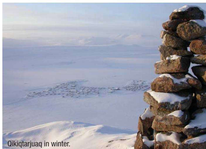
Qikiqtarjuaq in winter.