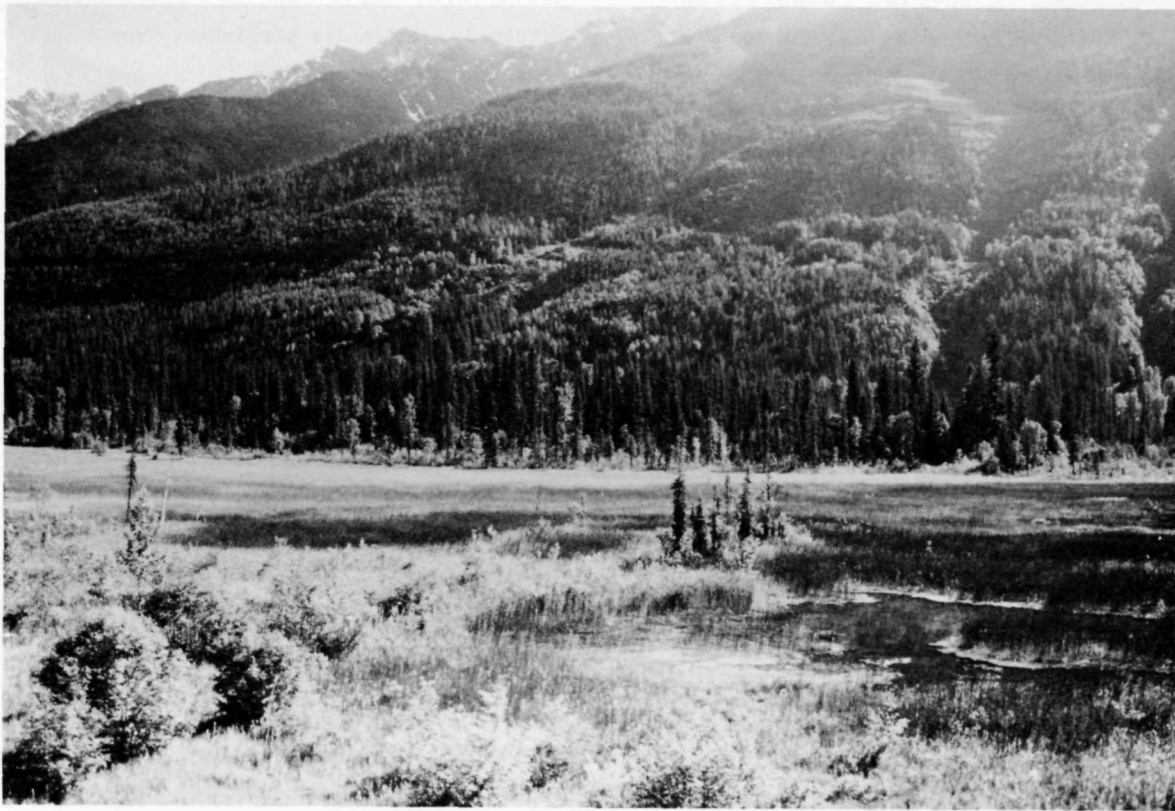
Figure 5. Beaver River alluvial flat and marginal fen (Loc. no. 13) in centre of the foreground. The easterly slopes of the Hermit Range form the background.

made by Soper, Szczawinski & Shchepanek in 1969, Haber & Shchepanek in 1972 and Soper & Given in 1973. A complete set of these collections is housed in the National Herbarium of Canada (CAN), Ottawa. Duplicate sets of most of these collections were distributed to the B.C. Provincial Museum (V) at Victoria or to the Parks Canada headquarters for Mount Revelstoke-Glacier Parks at Revelstoke, B.C.