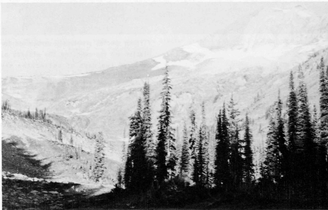
Figure 4. View looking northwest toward escarpment from the basin lying southeast of Fidelity Peak (to left of photograph).