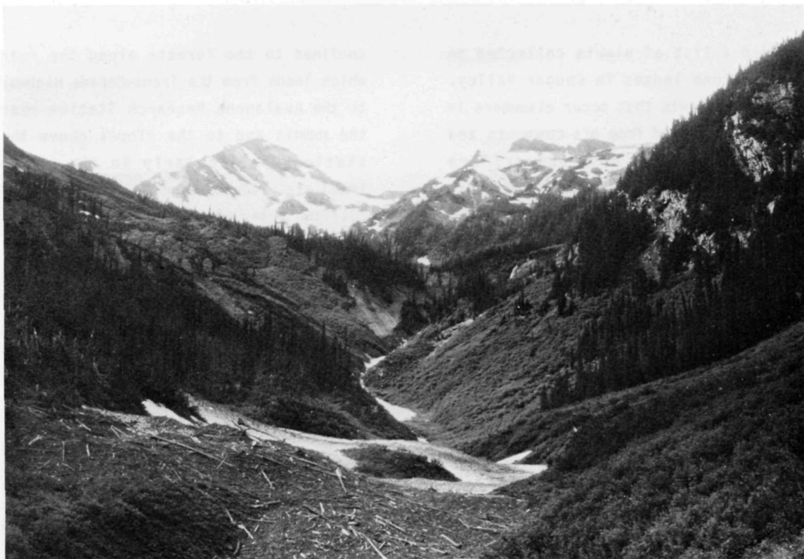
Figure 3. Lower Cougar Valley from 1220 m (4000 ft), looking northwest. The Nakimu Caves and upper valley lie beyond the ridge crossing the centre of view. In the foreground are the lower slopes of Cougar Mountain (left) and Cheops Mountain (right).