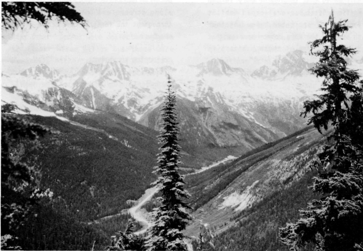
Figure 2. Rogers Pass as seen from Glacier Crest Trail looking northward toward the Hermit Range.

larger exposures such as those in the upper Cougar Valley and at Fidelity Mountain. Conditions for luxuriant plant growth in the valley of the Beaver River are ensured both by the high precipitation of the region and by the influx of nutrients supplied by the periodic deposition of sediment along the riverbanks. Upwelling of lime-rich waters also provides nutrients and habitats for characteristic fen species.