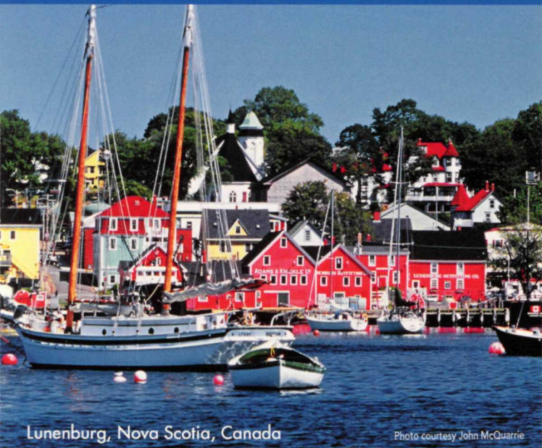
Lunenburg, Nova Scotia, Canada