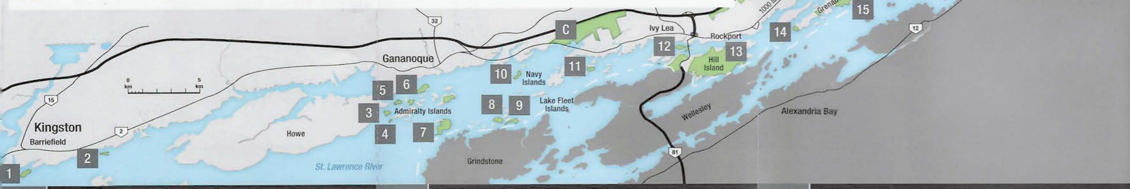
1 Cedar Island