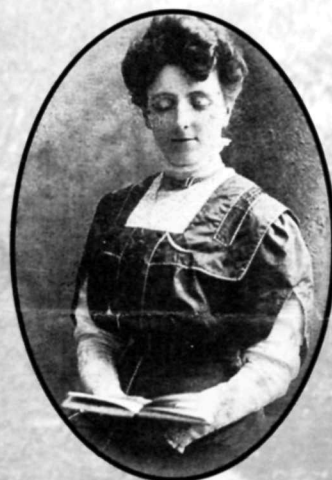
L.M. Montgomery, circa 1908

"Commemorating L.M. Montgomery as a person of national historic significance."