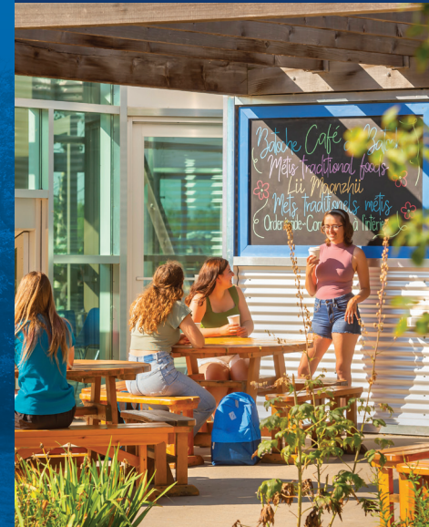
Batoche National Historic Site GPS Coordinates: 52°45'14.70"N 106°6'37.19"W